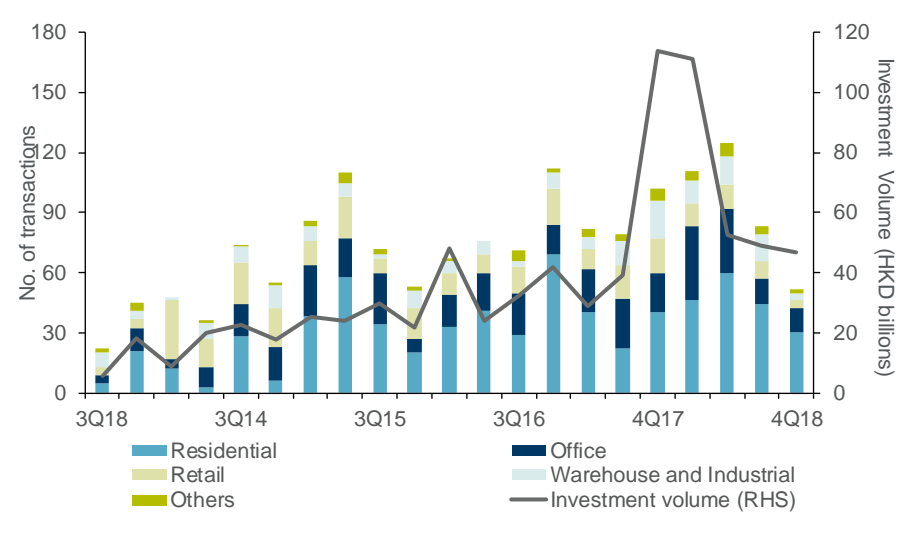
Figure 1 Number of Transactions Over HKD 100 million by Sector and Total Investment Volume (HKD billion)