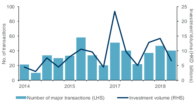
Residential Investment Volume (HKD million) and Number of Transactions above HKD 100 million